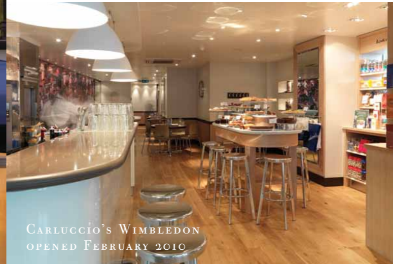
CARLUCCIO'S WIMBLEDON OPENED FEBRUARY 2010