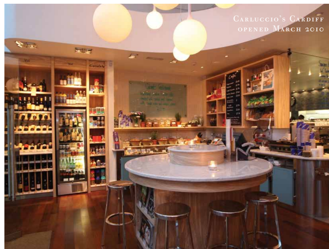
CARLUCCIO'S CARDIFF OPENED MARCH 2010

Shared commission available to non-retained agents