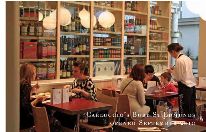
CARLUCCIO'S BURY ST EDMUNDS OPENED SEPTEMBER 2010